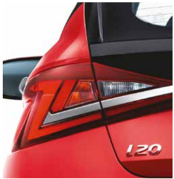
Z-shaped LED tail lamps

One look is all it takes to fall in love with the all-new i20. Its sensuous sporty design turns heads everywhere it goes. It is wider, longer and features the new electric sunroof. It's a seamless harmony of sleek looks and cutting-edge technological innovation.