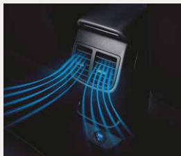
Rear AC Vents