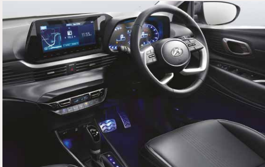
Sporty black interiors with copper inserts