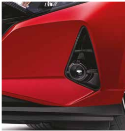
Front Projector Fog Lamps