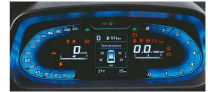
Tyre pressure monitoring system (highline) with display on MID