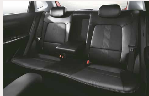
Rear seat armrest