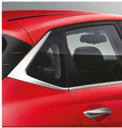
Chrome beltline with flyback rear quarter glass