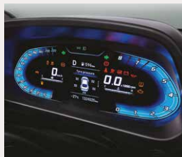
Digital cluster with TFT Multi Information Display (MID)

Step inside and get entranced by its exquisitely appointed, sporty black interiors with colour inserts. Relish the premium ambience every time you take it for a spin.