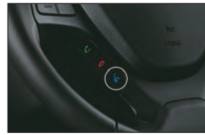
Voice Recognition on Steering