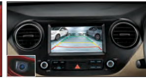
Rear Parking Assist System (with display on 17.64 cm Audio Screen)