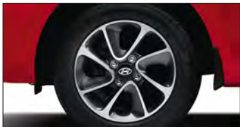
Diamond-cut Alloy Wheel

Chrome Door Handles | Rear Spoiler | Roof Rails Electric Folding ORVM with Turn Indicators | Sleek Waistline Molding