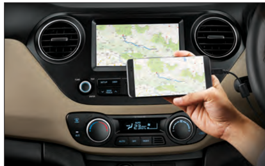
Mirror Link | Smart Phone Navigation

The GRAND i10 offers assistive technology at its very best with a class-leading 17.64 cm Touch Screen Audio Video System with smartphone connectivity, voice recognition and navigation support.