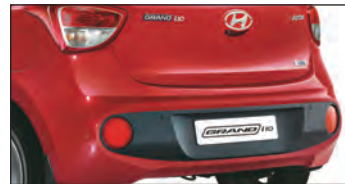
Dual Tone Rear Bumper