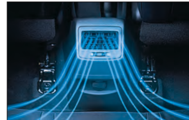
Rear AC Vent & Accessory Socket

With its thoughtfully designed interiors, ergonomically designed controls and advanced safety features, the GRAND i10 is sure to give you an enhanced driving experience.