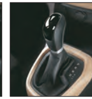
4-Speed Automatic Transmission