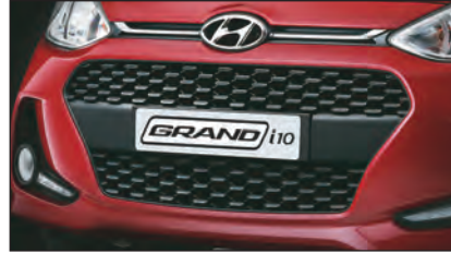
Cascade Design Grille - Bold New Design Identity

Pump-up the style quotient with the young and sporty GRAND i10. Its stunning looks, superior performance and advanced convenience features are sure to exceed all expectations.