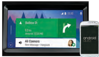
Android Auto Connectivity