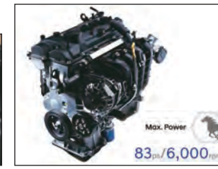
1.2L Kappa Dual VVT Petrol Engine