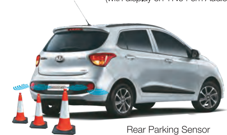
Rear Parking Sensor

With its thoughtfully designed interiors, ergonomically designed controls and advanced safety features, the GRAND i10 is sure to give you an enhanced driving experience.