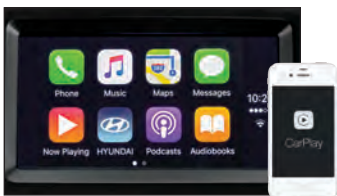
Apple CarPlay Connectivity