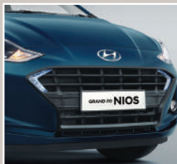
Glossy Black Radiator Grille*

Admire it from any angle, and The All New GRAND i10 NIOS will catch your eye with its bold stance and contemporary design. Check out its new Glossy Black Radiator Grille, Boomerang Shaped LED DRLs, Stylish Tail Lamp with Emergency Stop Signal, and Shark Fin Antenna for a different road presence.