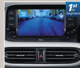
Driver Rear View Monitor