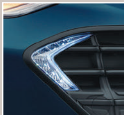
Boomerang Shaped LED DRLs