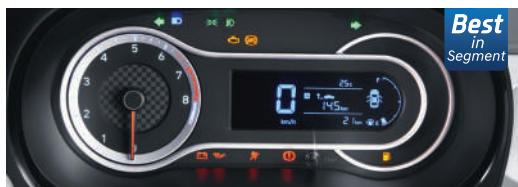
13.46 cm Digital Speedometer

The All New GRAND i10 NIOS gets its smart technology from the Hyundai stable; like the Best-in-segment 20.25 cm Touchscreen Infotainment System with Smartphone Connectivity. Advanced technology is always working behind the scene to make every drive a convenient yet richly immersive experience.