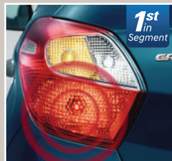
Stylish Tail Lamp with Emergency Stop Signal