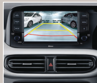
Rear Parking Camera with Display on 20.25 cm Screen

You will never feel unsafe in The All New GRAND i10 NIOS. From a Strong Body Structure to Standard Dual Airbags and ABS with EBD + , maximum care has been taken to integrate a plethora of safety features.