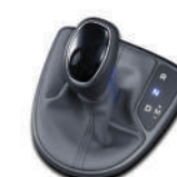
AMT in 1.2 Petrol