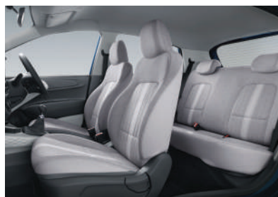
Wide and Spacious Cabin

Find all the space you need, in The All New GRAND i10 NIOS. Step inside to experience its premium fit and finish. Revel in the comfortable and ergonomically designed cabin for maximum driving pleasure.