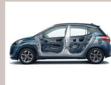
Strong Body Structure-65% (AHSS + HSS)