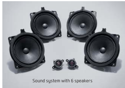
Sound system with 6 speakers

The audio system features 6 speakers for outstanding, life-like reproduction and enjoyment of diverse media, including radio, CD, and MP3 files. Options include an LCD and optimally placed function buttons that enhance the convenience of listening to music.